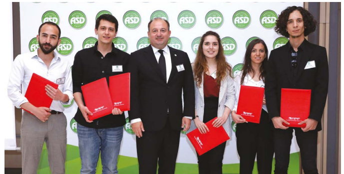
Students that received awards in AsiaStar