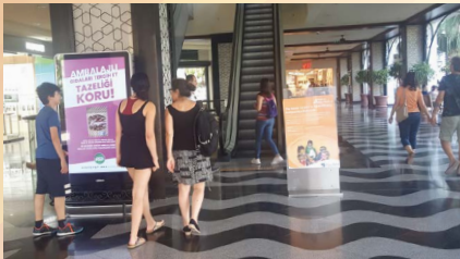
İzmir, Mavi Bahçe AVM