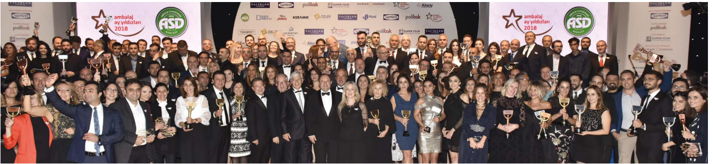
The World Crescents and Stars for Packaging 2018 winners.