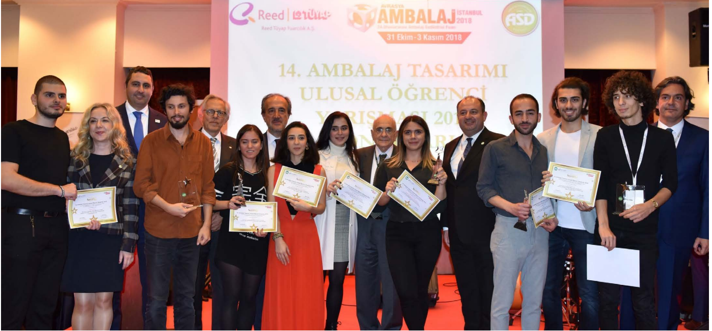
14th Packaging Design National Student Competition 2018 winners received their awards in Eurasia Packaging Fair in Istanbul.