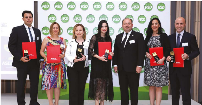
Companies that received awards in AsiaStar