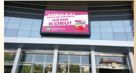
Gaziantep, Sanko Park AVM