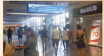
İzmir, Agora AVM