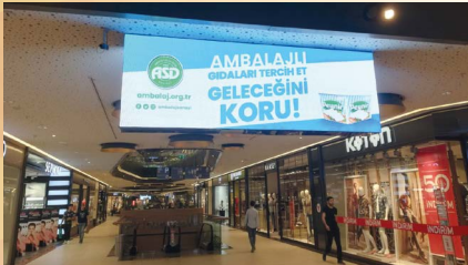
Gaziantep, Primemall AVM

insufficient knowledge of the importance of packaging in terms of health and he also said, “As of April, we continue the campaign we started last year. Because we want to tell the society about the relationship between food safety and packaging. Packaging is an important product especially in the food and beverage sectors. Food packages are designed to maintain the properties of the product they contain. Releasing a product to the market free from additives is possible through rigid and multi-layered packages. Choosing packaged food will also allow you to see the expiry date and when and where the product was produced. Packaging ensure fresh fruits and vegetables are transported from field to fork through reliable food chain, thereby preventing waste in the industry. We need to choose packaged food that are properly packaged and kept in a hygienic condition if we want to live a healthy life. The packaging contributes to the national economy. Packaging makes the product traceable, which in turn prevents out-of-record trade.