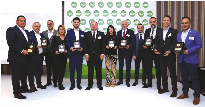
New members of ASD.